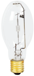
E39, ED-28, Clear