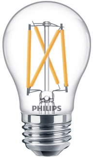
Single Contact Medium Screw